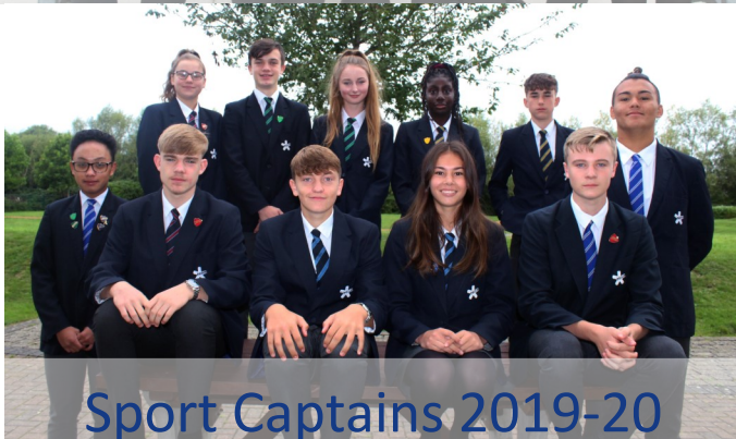
Sport Captains 2019-20