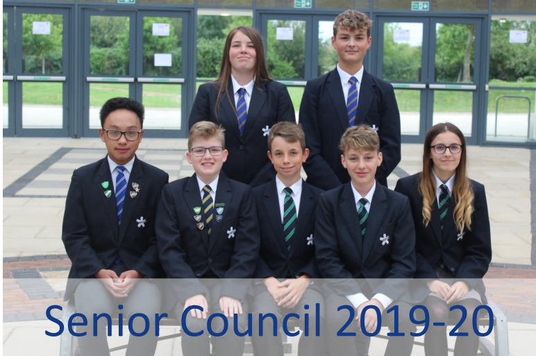
Senior Council 2019-20